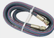
1.5M high-pressure charging hose