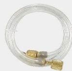
1.5M transparent charging hose